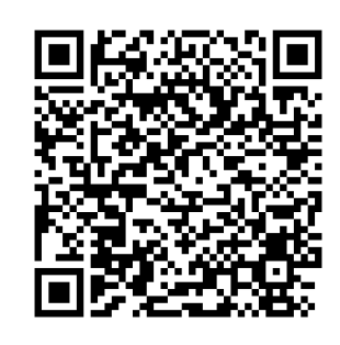
Scan the QR code to see more pictures like this in our online gallery

A total of twenty students from Nisga'a Elementary Secondary School (NESS) successfully completed the 5-week Trades Awareness Program offered by the UA Piping Industry College of BC. The program was hosted at NESS and led by Kevin Jeffery who is the Special Projects Coordinator. The program introduced the student participants to various trades available on campus providing a comprehensive overview and practical experience. From January 20-March 14, 2025, the student participants engaged in hands-on activities covering multiple trans disciplines including the following: Electrical, Hair Dressing, Carpentry and Welding, Culinary Arts and Piping. The immersive experience allowed the students to gain valuable insights and practical skills in each field that broadened their understanding and appreciation of the diverse career opportunities within trades. This was a collaborative effort between Ursula Azak, GVG Employment Coordinator, NESS and UAPICBC.