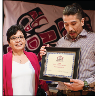
Michael Morven YMCA Youth Award