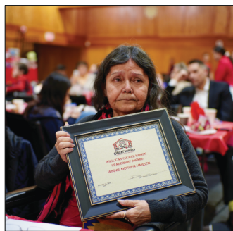
Winnie Morven-Hansen ACW Leadership Award