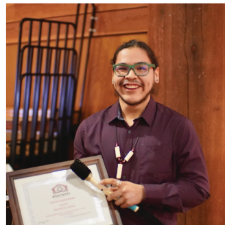
Patrick Guno Youth Leadership Award