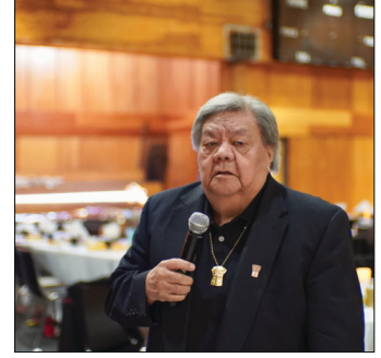
Edmond Wright Man of Distinction Award