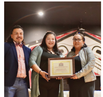
JANT Top Fundraising Group