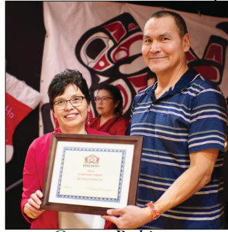
George Robinson YMCA Leadership Award