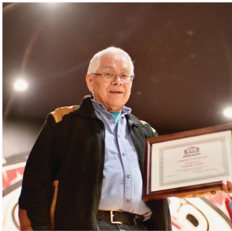
Eugene Adams Community Volunteer Award