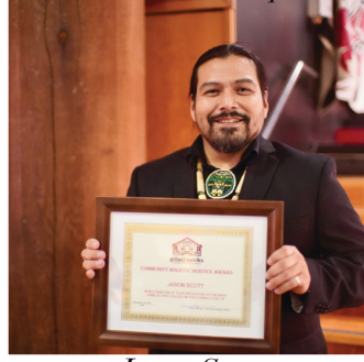
Jason Scott Traditional Holistic Service Award