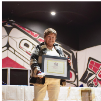
Eva Clayton Woman of Distinction Award