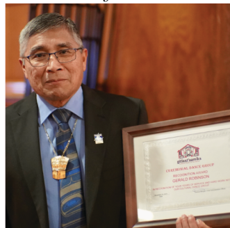
Gerald Robinson Ceremonial Dance Group Award