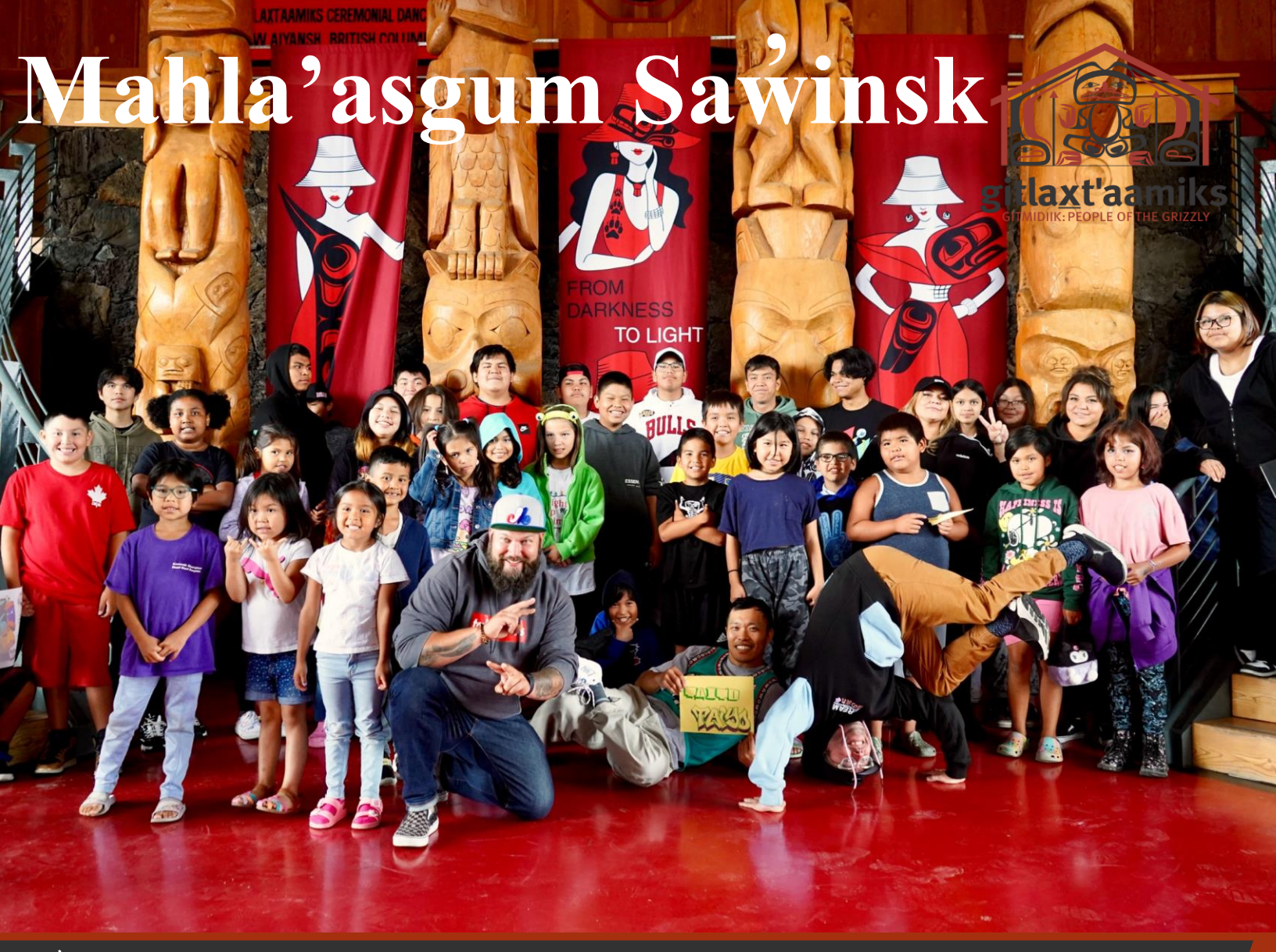
Wiihoon / August 2023 | Gitlaxt'aamiks Village Government