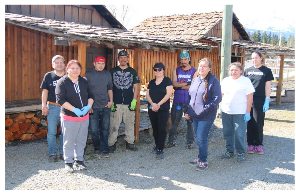
Smoke House Crew 2020